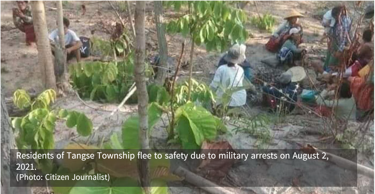
Residents of Tangse Township flee to safety due to military arrests on August 2, 2021.

Four villagers who were sheltering from the war-ridden region were shot and killed by the junta on accusations of having ties and providing information to local PDFs. 61 The four victims were identified as 55-year-old U Thaung Myint, 50-year-old old Daw Chaw Hla and two men who were 30 years old. In addition, 11 elderly people were arrested and then released the following day. 62