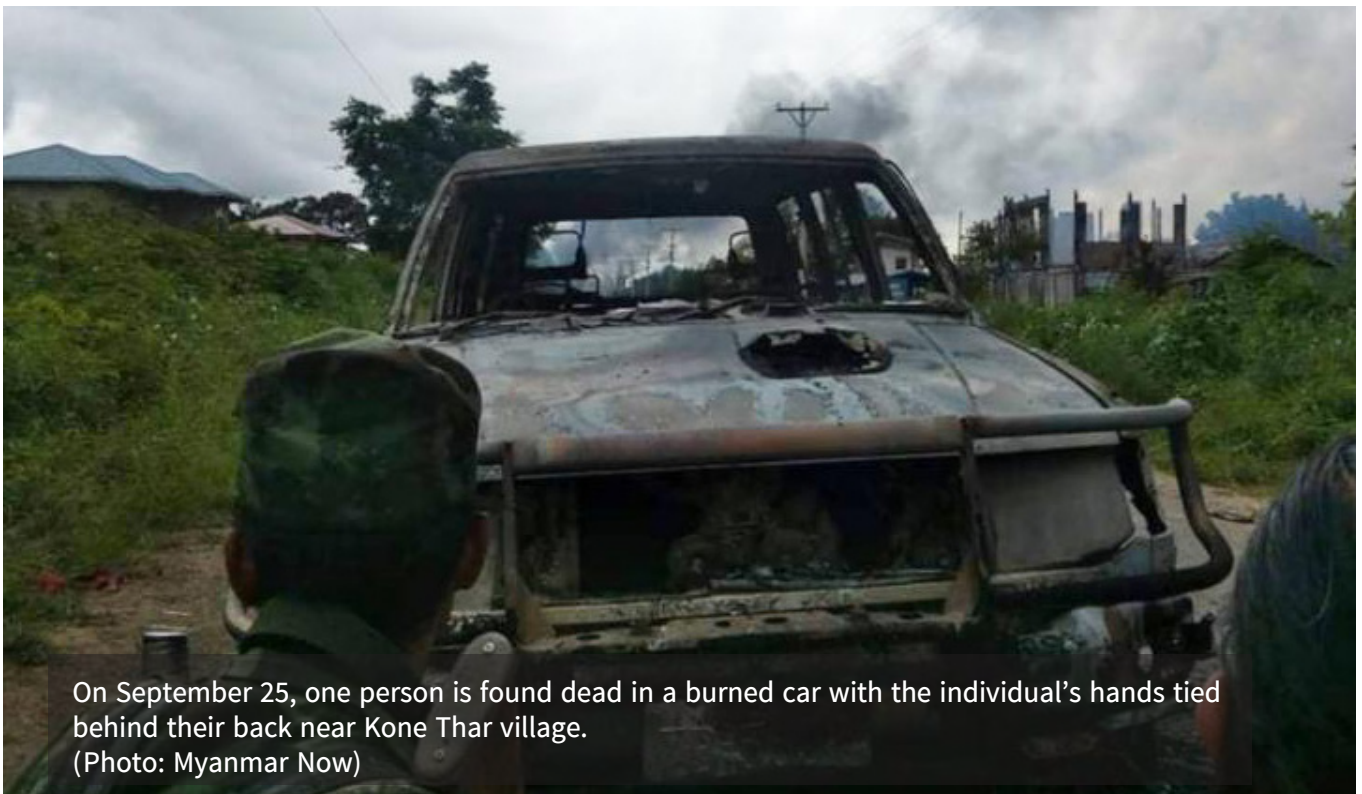
On September 25, one person is found dead in a burned car with the individual's hands tied behind their back near Kone Thar village.

Artillery shells have regularly fallen on civilian homes across the state leading to growing numbers of injuries and casualties. Even elderly people are not safe. A 70-year-old villager from Demawso Township was shot and killed by soldiers on 26 September by the junta. 49 In a particularly cruel