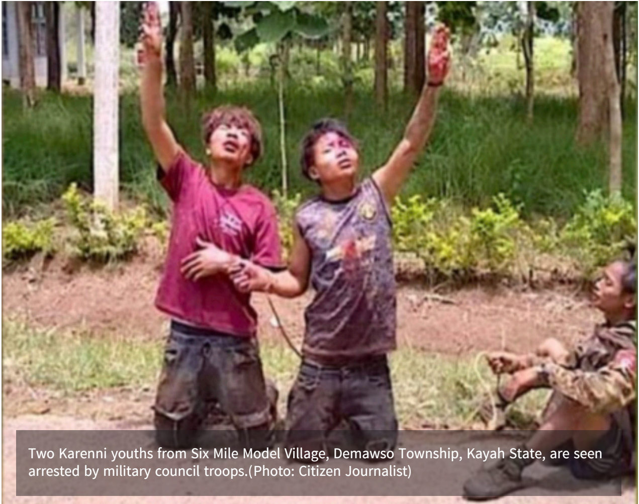
Two Karenni youths from Six Mile Model Village, Demawso Township, Kayah State, are seen arrested by military council troops.

Those abducted between 4 and 8 September were used as human shields during military offensives. A couple arrested near their farm in Shwe Pi Aye village were forced to guide the military soldiers and stand in front of them in case Karenni resistance fighters began firing. 43 Others were taken away at gunpoint to undisclosed locations. 44 Between 27 August and 12 September, 26 people had been arrested by the junta in Demawso and Loikaw townships and over 200 civilians, including 30 volunteers supporting IDPs, had