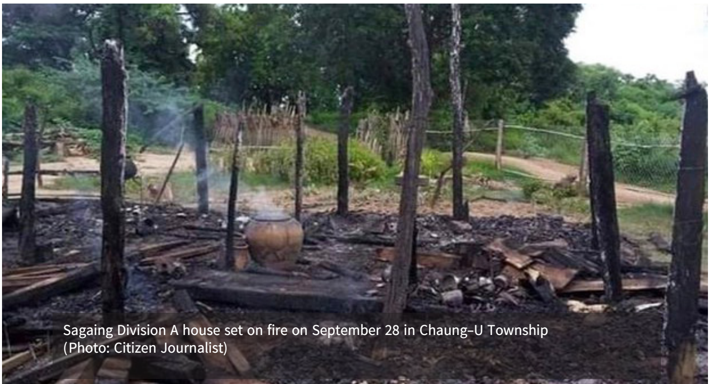
Sagaing Division A house set on fire on September 28 in Chaung-U Township

The township has also been exposed to arson by the junta. On 23 September, junta soldiers began firing at homes in Kye Kone village where 7 houses were reduced to ashes, and thousands of paddy farms were destroyed. 70 On 24 September, the junta repeated the exact same offensives and damaged more homes and paddy farms. By the end of September, two more homes were set on fire by the junta in Makyeboke village, and later fired artillery shells into the hills where locals had fled. 71 The burning of civilian houses and villages is being used systematically in Sagaing region to force local villagers to retreat and lose faith in the