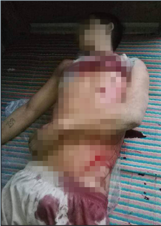
Photo: 21-year-old man killed by Burma army shelling

On 27 January the Burma army used two military jets to drop bombs on a KIA-controlled village in Tanai Township, Kachin State. One civilian was killed and two were injured. Several homes were also destroyed. Some 500 people fled the attack while others were blocked from escaping by Burma army soldiers. Those fleeing faced abuse from soldiers at checkpoints.