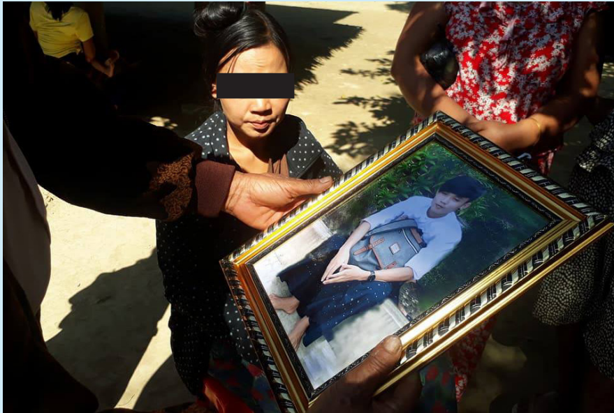
Photo: An 18-year-old Arakanese man shot to death by police during a protest in Mrauk-U