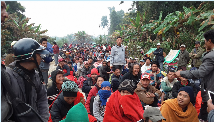
Photo: Trapped workers wait for a gate to open in Payin Maw, Kachin State | Credit: KWAT

Five civilians were injured after Burma army shells hit their temporary shelter in Tanai Township, Kachin State. The family had been staying in a wooden house while some of them worked in the Tanai amber mines. The victims were two sisters, aged 18 and 31, a 18-year-old man, and two children. The injured fled to a clinic some four hours' away, where they still were at the time of interview.