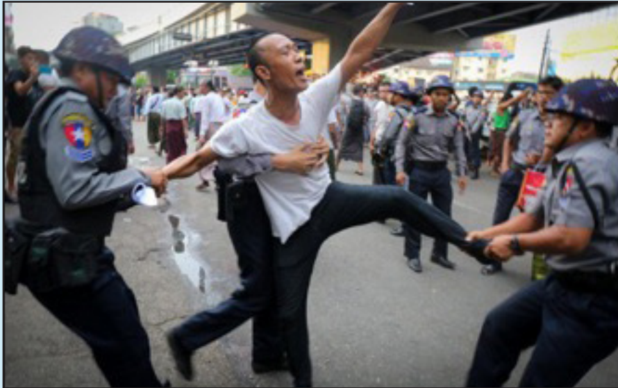
Photo: Police restrain a protester in Rangoon on 15 May 2018 | Credit: Victoria Milko

The right to protest was severely restricted over the reporting period. In January, a police crackdown on a protest of some 4,000 people in Arakan State led to death of seven people, with a further 12 being injured (Case 15). The demonstrators were protesting a local government decision to withhold permission for an annual event commemorating the fall of the Arakan kingdom in the 18th Century.