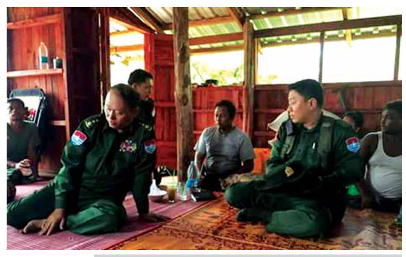
Military officials visiting to the family of victims who were killed by the soldiers

Approximately 300 supporters, including villagers and residents from across Ye Township, Parlain Region, Kyaungywa Village, Lamine Town and Mawkanint Village, as well as human rights activists, members of civil society organizations, and Buddhist monks gathered in Ye Township in southern Mon State to pray for the two innocent victims from the Ma Gyi Chaung Wa village shooting. Attendees mentioned that locals across Ye Township are very concerned about the Ma Gyi Chaung Wa village shooting and its two innocent victims. They also claimed that serious human rights violations have been committed around Ye Township for a long time. The people of Ye would like to see justice served in this case, because they think punishment for the soldiers involved will help bring stability to the region. They also want to make others aware of the Ma Gyi Chaung Wa shootings as well as ongoing conflict in the region.